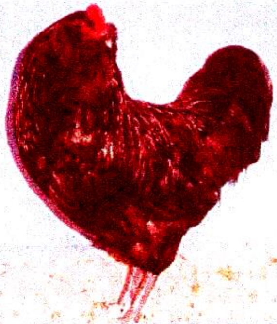
Black Large Fowl Ameraucanas