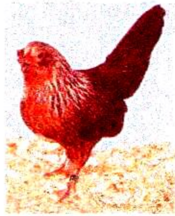
Silver Bantam Ameraucanas