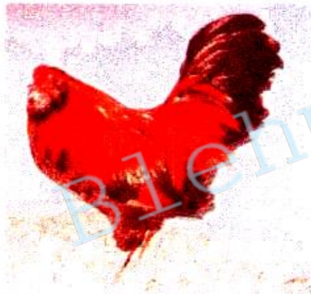
Wheaten Bantam Ameraucanas